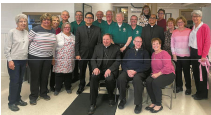
Saint Francis of Assisi, pray for us!