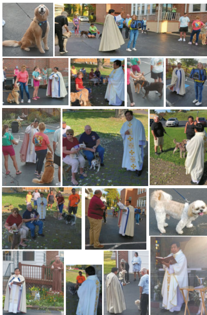
The Blessing of Pets - Wednesday, October 4, 2023 on the Feast of Saint Francis of Assisi, our patron

at the social hall in Footedale. Doors open at 2pm; drawings begin at 2:30 and take place every ten minutes through 7:00 pm. Donation of $20 includes food and refreshments. Tickets are available at the Parish Office Monday through Friday, 9:00 am to 4:00 pm.