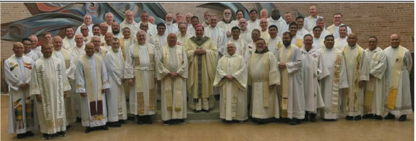
Annual Priest Convocation - October 10, 11 & 12 May God bless the priests of the Diocese of Greensburg! ♥

God is greater than this world and His truth is stronger than all its ideologies. Remember that no matter how we vote, who we agree with or what our background is, we belong to Him alone.