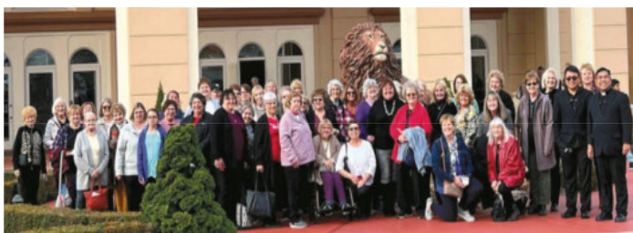
The Miracle of Christmas - November 9 Sight and Sound Theatre, Lancaster, PA

Parish Family Christmas Tree - Everyone is invited to bring an ornament, unique to you and your family, to place on our Parish Family Christmas Tree.